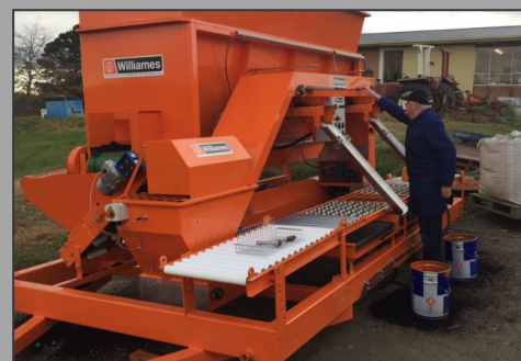
ABOVE: Transportable Pot Filler